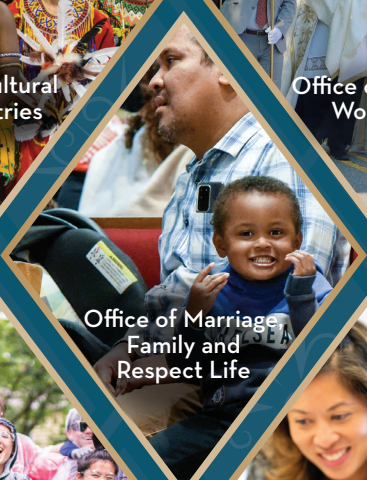
Office of Marriage, Family and Respect Life