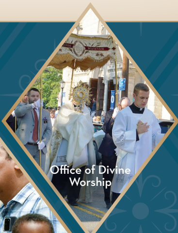
Office of Divine Worship