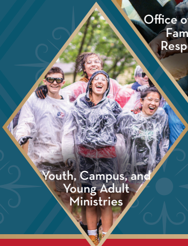
Youth, Campus, and Young Adult Ministries