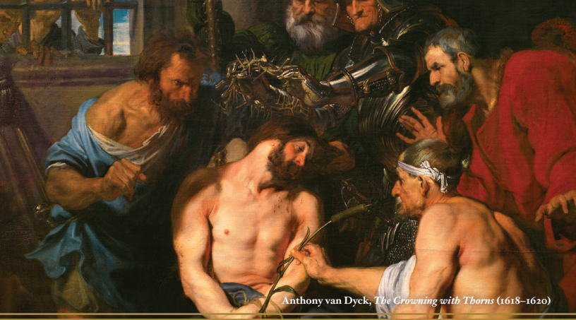
Anthony van Dyck, The Crowning with Thorns (1618–1620)