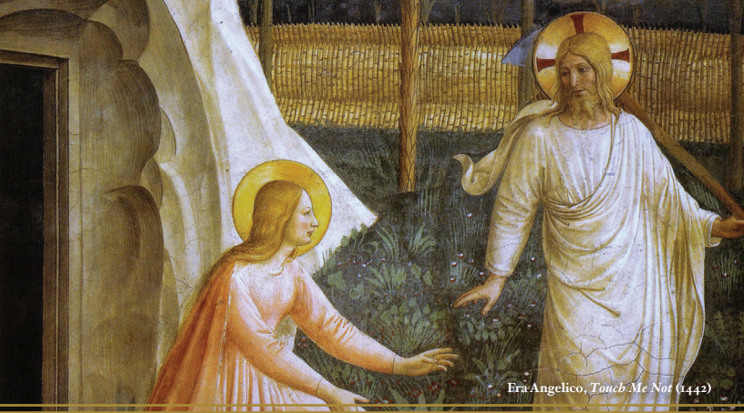
Era Angelico, Touch Me Not (1442)