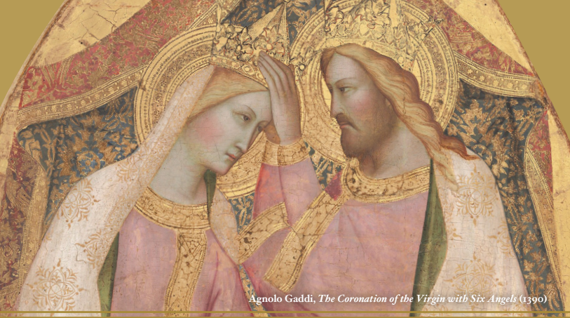
Agnolo Gaddi, The Coronation of the Virgin with Six Angels (1390)