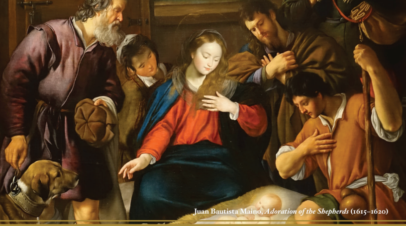
Juan Bautista Maino, Adoration of the Shepherds (1615–1620)