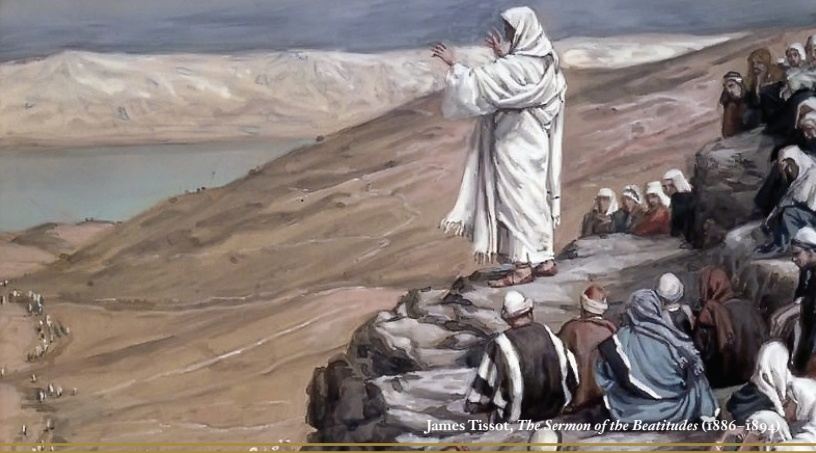
James Tissot, The Sermon of the Beatitudes (1886-1894)