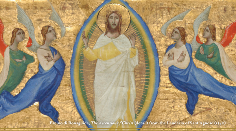
Pacino di Bonaguida, The Ascension of Christ (detail) from the Laudario of Sant'Agnese (1340)