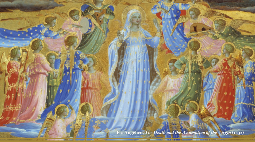
Fra Angelico, The Death and the Assumption of the Virgin (1432)