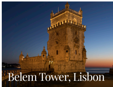
Belem Tower, Lisbon