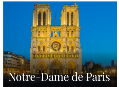
Notre-Dame de Paris

$4292* + $557 Airport Taxes, Security & Airline Fuel Fees