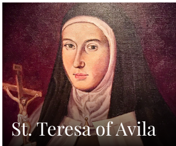
St. Teresa of Avila