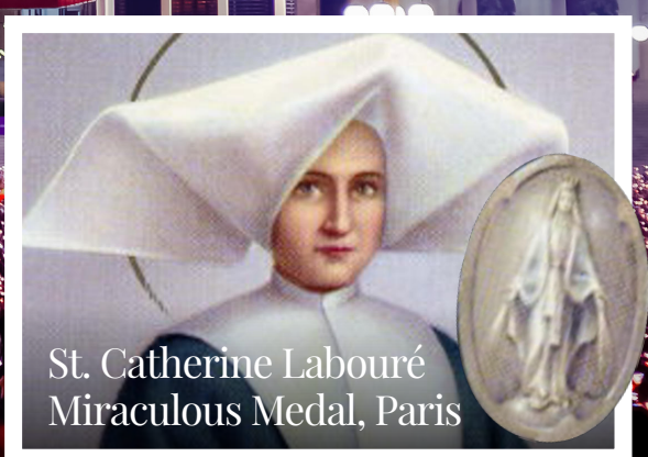
St. Catherine Labouré Miraculous Medal, Paris

Early Registration SAVE $100 SEE WEBSITE FOR DUE DATE