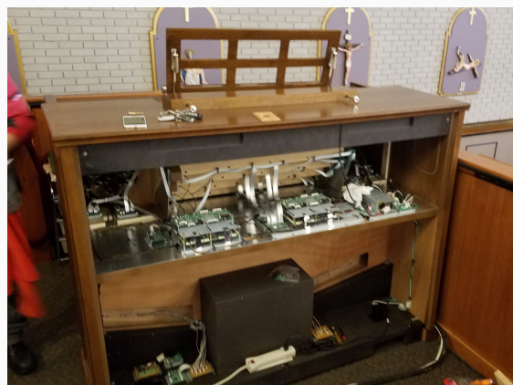
New: Three Computer Processing Units

The new instrument replaces our 35-year-old organ—that we bought used 25 years ago. The upgrade in technology cannot be overstated!