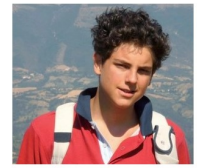
Bl. Carlo Acutis 1991—2006 Patron of Youth and Computer Programmers

“Enter into the Silence. Silence is key to sanity and wholeness. We can only “hear” the voice of God if we are quiet. Take out the ear buds of your iPhone, iPod, and iTunes and listen to God, the great I AM.” 1 “In responding to God’s call, young people see their own ecclesial horizon expand; they are able to consider various charisms and to undertake a more objective discernment. In this way, the community becomes the home and the family where vocations are born.” Francis I 1