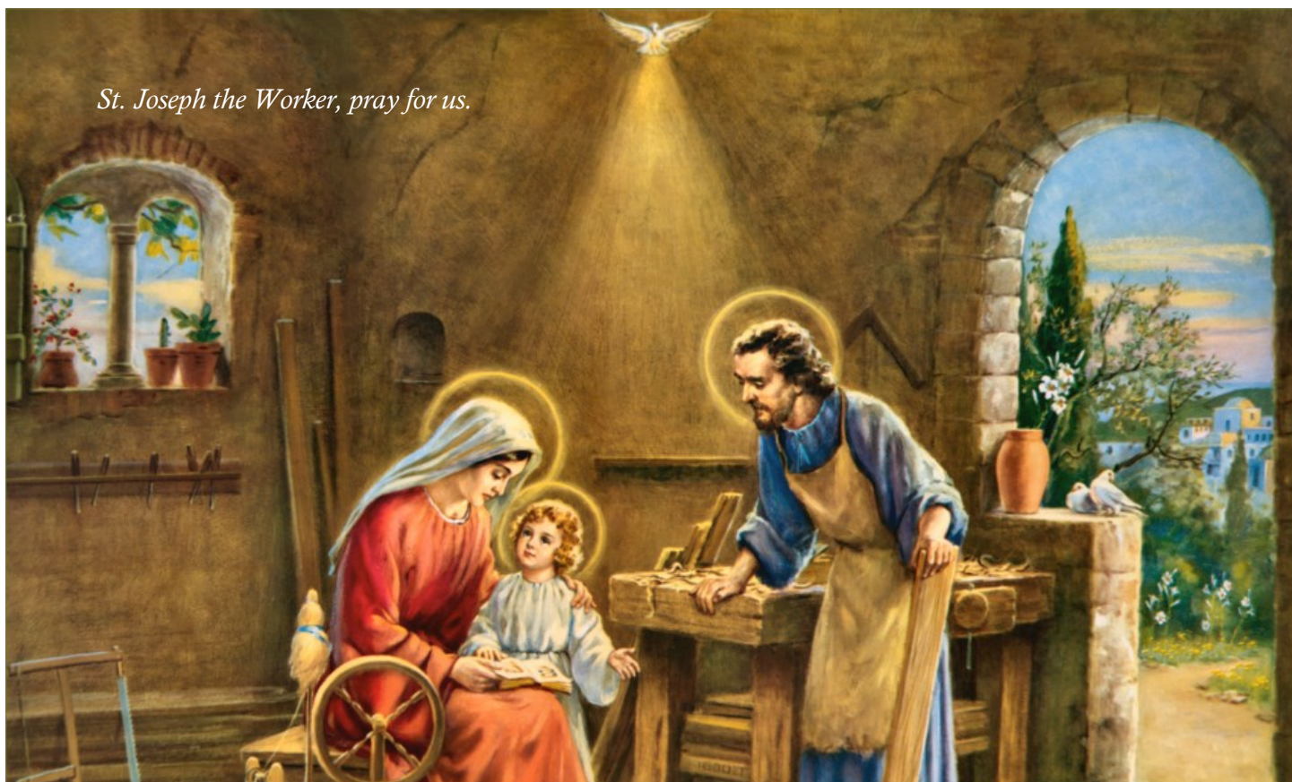
St. Joseph the Worker, pray for us.